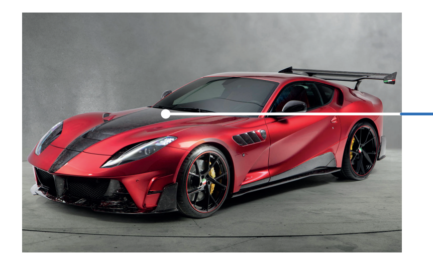
Compounds for Automotive SMC Polynt-SMCarbon® (Photo of the Mansory Stallone 812: the car body is entirely made in Polynt-SMCarbon®.)

Contact us for further needs, our Technical Assistance will support you in choosing the best product solution.