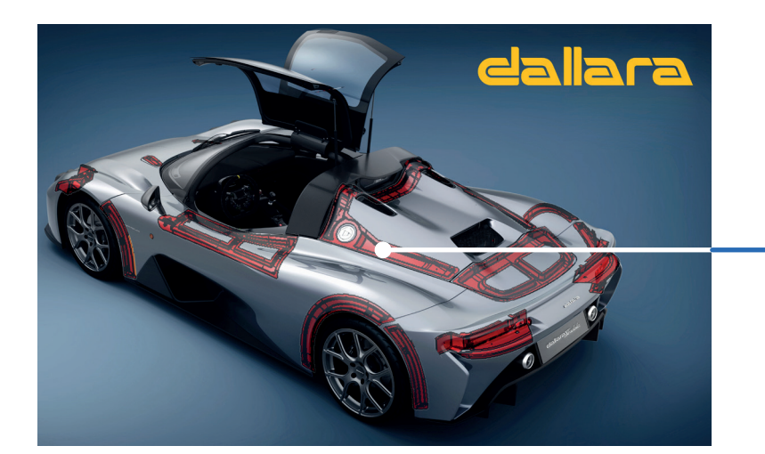
Compounds for Automotive SMC: Polynt-SMCarbon<sup>®</sup> used for 9 inner structural parts. (Photo of Dallara Stradale, the new road car of Dallara.)

Compounds for Automotive Carbon Fiber: Polynt-SMCarbon® (Photo of the Aston Martin DB11)