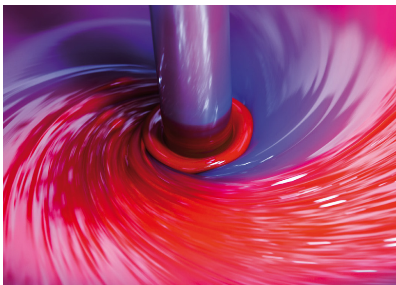
Blending of Gel Coat

In particular for the EMEA and Asia Pacific Areas, POLYCOR® is the most complete Gel Coats and Top Coats product line for the composite industry and its excellent quality is recognized by users worldwide.