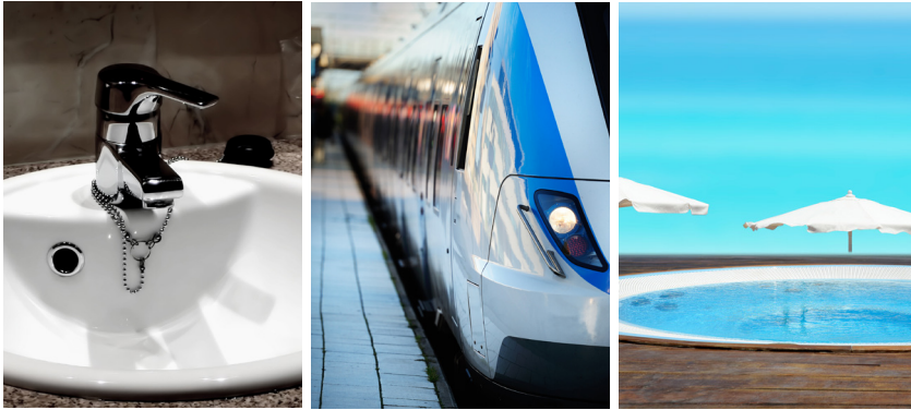
These photos show the attractive aesthetics of the high gloss Gel Coat finish on the white sink, the pool and the train parts.

POLYGEL® is the most diverse Gel Coat line developed for interior and exterior finishing and protection. Its signature characteristic of easy application on all surfaces and excellent stability guarantees the brightness and colour of the original product. Studies have shown POLYGEL® produces excellent features, and it is regularly formulated to satisfy specific requests from a variety of market segments.