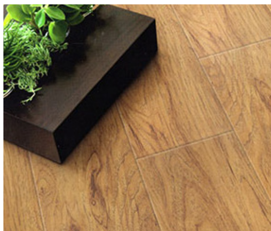
Example of GPP flooring application