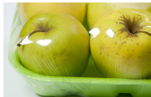
Three examples of plasticizer applications: medical applications, cling film and tensile structure.