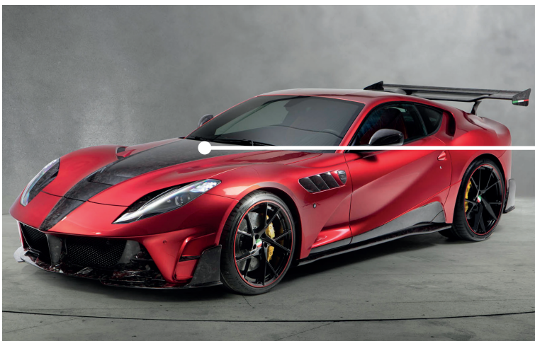
Compounds for Automotive SMC Polynt-SMCarbon® (Photo of the Mansory Stallone 812: the car body is entirely made in Polynt-SMCarbon®.)

Contact us for further needs, our Technical Assistance will support you in choosing the best product solution.