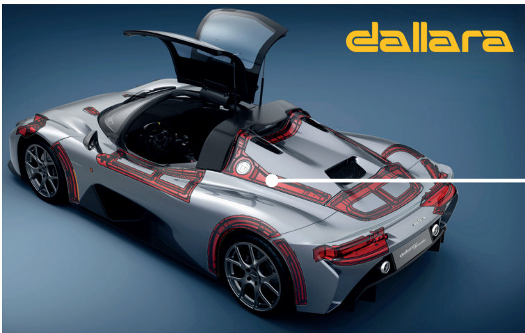
Compounds for Automotive SMC: Polynt-SMCarbon® used for 9 inner structural parts. (Photo of Dallara Stradale, the new road car of Dallara. Photo by Dallara)